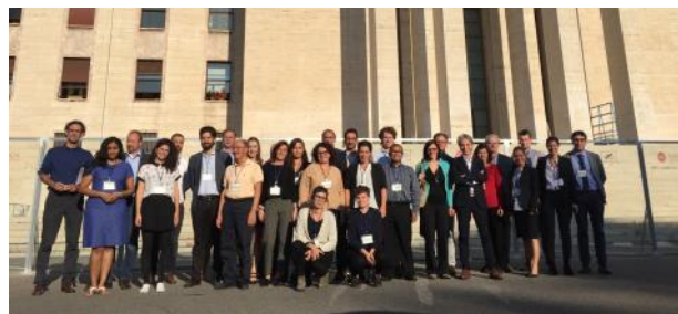
The October 2017 first General Assembly gathered the STAR-ProBio project team in Rome, 2 days of cross-disciplinary discussions on how to squeeze the most added value for the emerging bio-economy out of the next 2.5 years of our ambitious project.