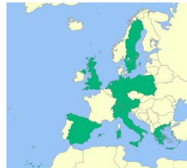
STAR-ProBio geographical distribution of partners