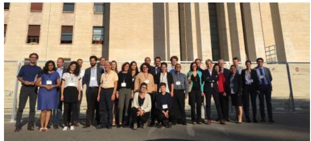
The October 2017 first General Assembly gathered the STAR-ProBio project team in Rome, 2 days of cross-disciplinary discussions on how to squeeze the most added value for the emerging bio-economy out of the next 2.5 years of our ambitious project.