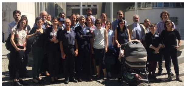
Contagious enthusiasm are words that characterised the May 2017 STAR-ProBio kick-off meeting , hosted by TU Berlin.