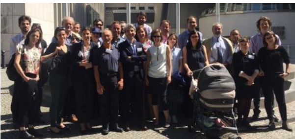
Contagious enthusiasm are words that characterised the May 2017 STAR-ProBio kick-off meeting , hosted by TU Berlin.